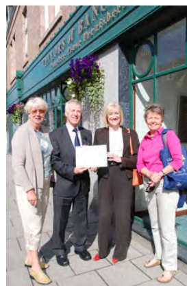
Congratulations to Taylors of Banchory - The 2010 Bonnie Banchory Shop Front Winner.

The team have been most impressed by those businesses that have taken it upon themselves to tidy-up and plant the areas around their own premises, and they would like to thank all those who have helped to make Banchory so Bonnie.